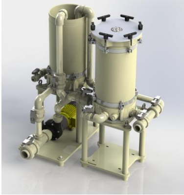
Super Space-Saver with slurry

SERFILCO filters can accommodate a variety of filter media including cartridges, disks, bags, permanent media or carbon and GAC. The rugged construction features a low pressure drop for long intervals of continuous high flow and long service life.