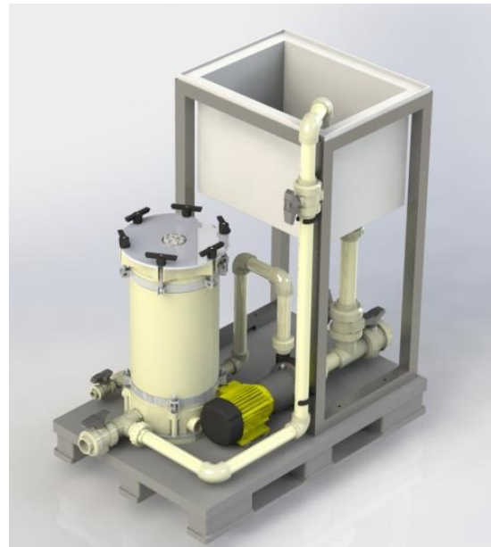
Guardian with optional slurry tank

SERFILCO Filtration Systems are compact, corrosion resistant and extremely simple to operate. A choice of construction materials allows their use with most liquids, including strong chemicals at elevated temperatures.