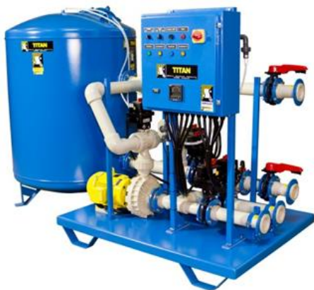
Titan Automatic Filter

SERFILCO filters can accommodate a variety of filter media including cartridges, disks, bags, permanent media or carbon and GAC. The rugged construction features a low pressure drop for long intervals of continuous high flow and long service life.