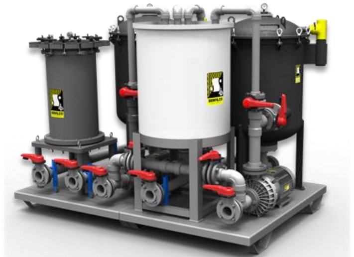
Optiflo with slurry and bypass carbon

Choose a basic filtration system with your choice of media, pump and filter chamber. Then select from a wide range of optional equipment to customize your system. Call us and we'll help you select the perfect system for your application.